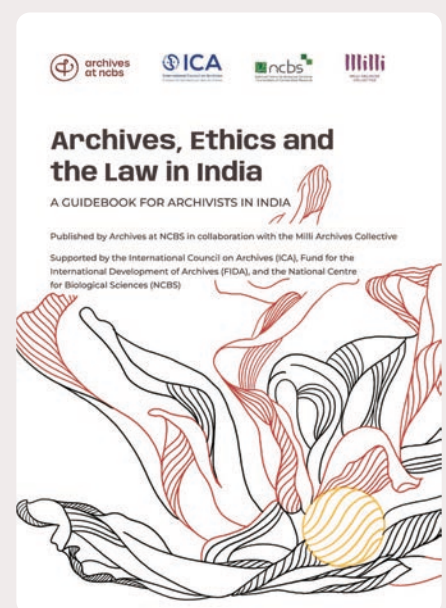
Guidebook for Archivists

Digital tools at the intersection of artificial intelligence and archives.