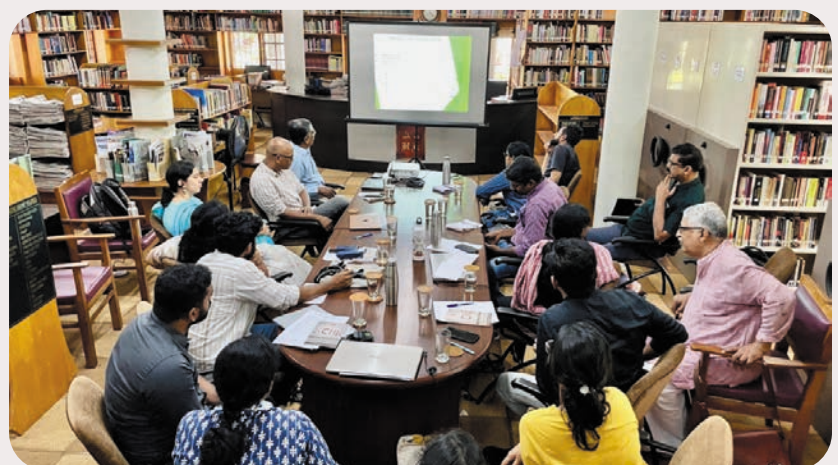
Kerala Council for Historical Research - two-day archival training workshop